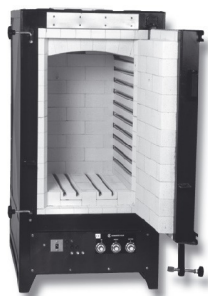
FRONT LOADER range