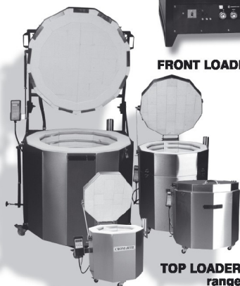
TOP LOADER range

Cromartie Kilns Ltd Park Hall Road, Longton Stoke on Trent ST3 5AY U.K. Tel: 01782 313947 Fax: 01782 599723 email: enquiries@cromartie.co.uk