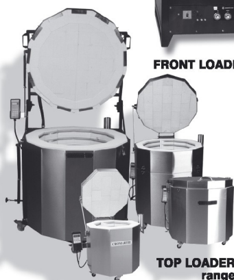
TOP LOADER range

Cromartie Kilns Ltd Park Hall Road, Longton Stoke on Trent ST3 5AY U.K. Tel: 01782 313947 Fax: 01782 599723 email: enquiries@cromartie.co.uk