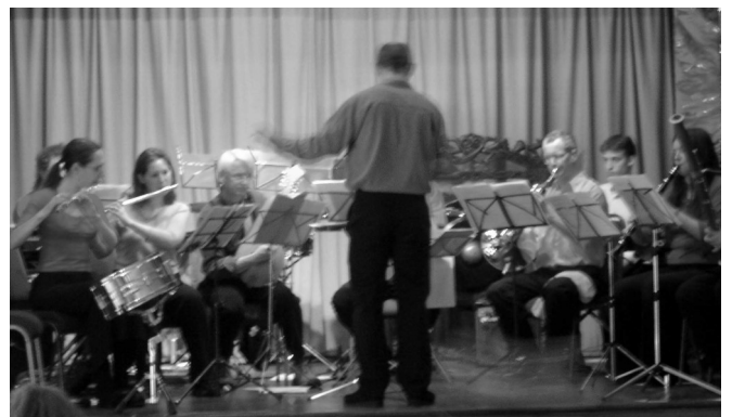
COMA contemporary music ensemble at Café Hall