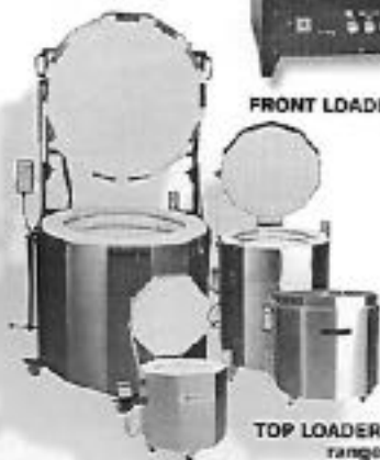
TOP LOADER range

Cromartie Kilns Ltd Park Hill Road, London Stoke on Trent ST3 8NY U.K. Tel: 01782 313947 Fax: 01782 589723 email: enquiries@cromartie.co.uk