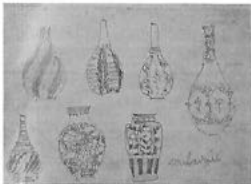
Drawings for decorative pottery for Pilkington's Tile & Pottery Company