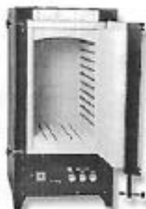
FRONT LOADER range