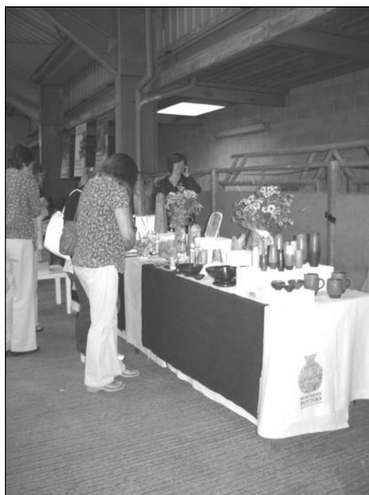
Potfest stand 2008

We will also be having a promotional stand again, and are looking for members to help out for a day or a half day, talking to visitors, giving out information, signing up new members etc. Sylvia Glover will be involved in this (I have rashly booked a stand this year, so shall be trying to sell a few of my own pots for a change). So, if you're interested in helping either with the bridge building, or promoting NPA, please get in touch with me.