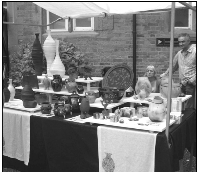
Earth & Fire 2008

Once again NPA will be having a group stand at Earth & Fire, and are offering an opportunity for four members to participate. An application form is included with this newsletter – please fill it in and return it to me by 12 January 2009 at the latest. The event takes place over three days, rather than two as in previous years, and the stand costs £260. This will be shared between the four successful artists, so that's £65 each. A shortlist of applicants will be sent to the event organisers for the final selections to be made. If successful, you will be expected to be present throughout the event and to share staffing duties with the other artists.