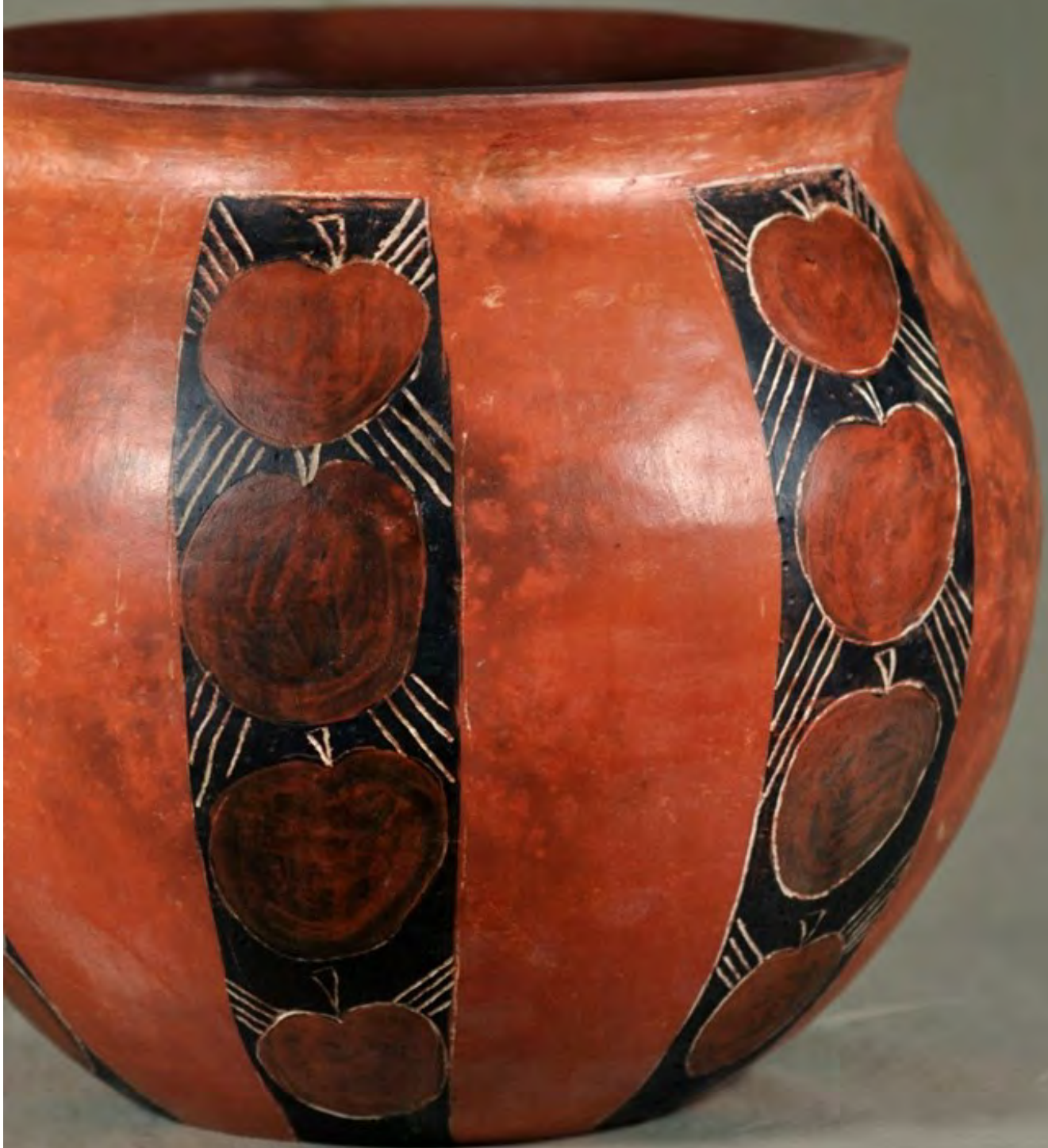
Chris Utley Apple pot, hand built, burnished, smoke fired