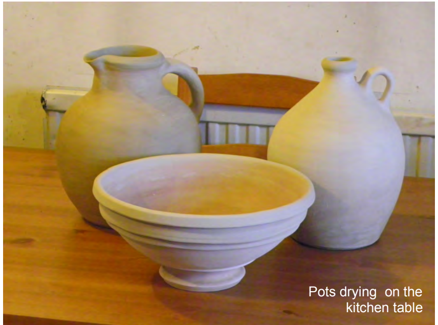
Pots drying on the kitchen table