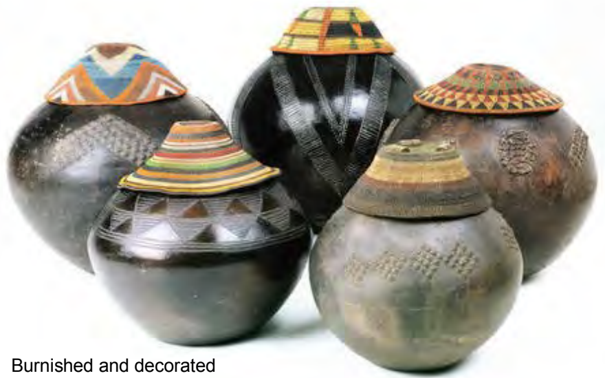
Burnished and decorated

Brewed from sorghum wheat and millet, besides its use for special events the beer is used daily as a health giving part of the diet. Just like Newcastle Broon!