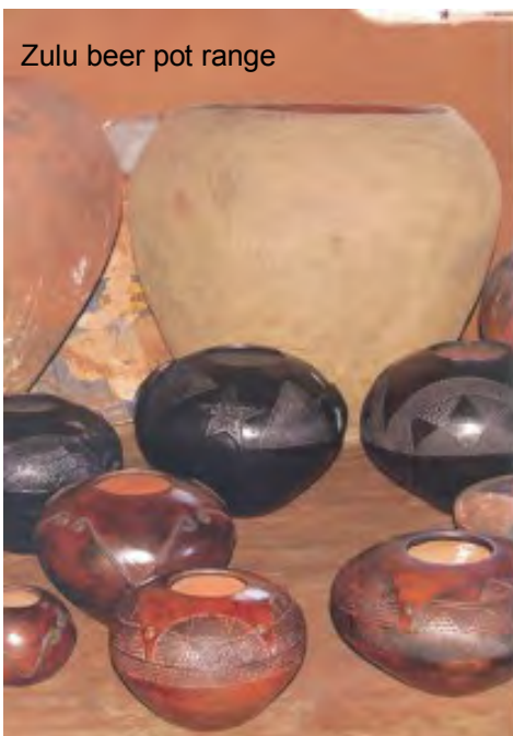
Zulu beer pot range

Inevitably perhaps, such iconic pots have been replaced by plastic for domestic use. Juliet Armstrong's research from the late 1990's aimed to promote and value the specialised ceramic skills of women makers and secure for them enhanced financial returns for their artwork.