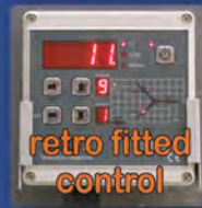
retro fitted control