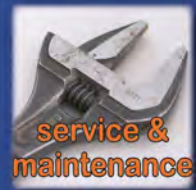
service & maintenance