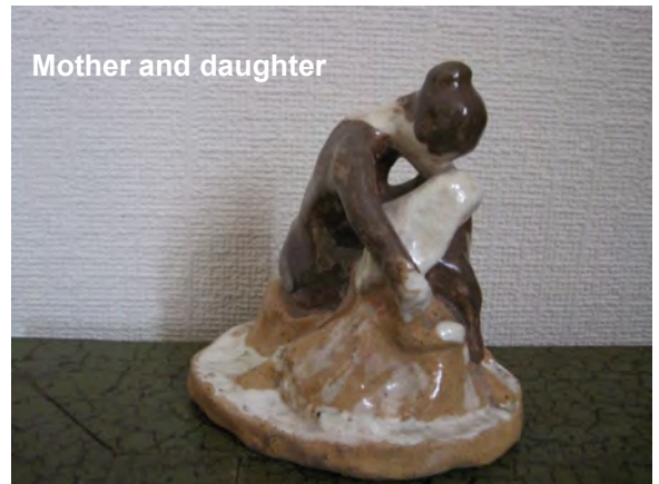
Mother and daughter

I always remembered that first excitement of working with clay on the art projects and, when my own children were older, signed up for ceramic and sculpture classes at Cleveland College of Art and Design. Later I acquired a kiln and my own small workshop. Of course, there have been many “worsts” over the years, but in spite of frustrations, I like to think that nothing has been wasted and that these disasters can be put down to experience and surely must be character-forming... if nothing else.