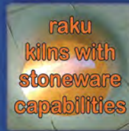
raku kilns with stoneware capabilities