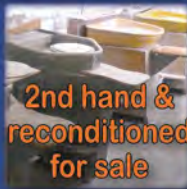
2nd hand & reconditioned for sale