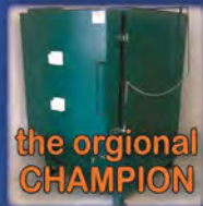
the original CHAMPION