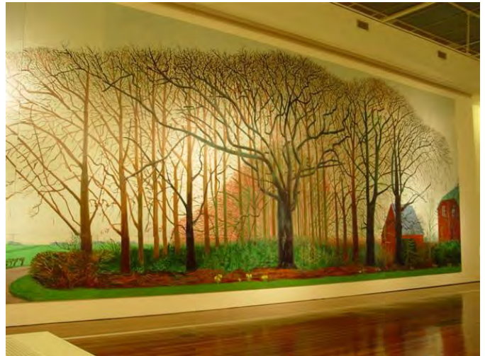
Bigger Trees at Warter - David Hockney