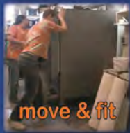
move & fit