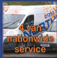
4 van nationwide service