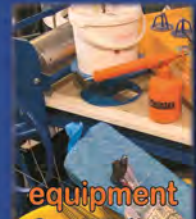
equipment & supplies