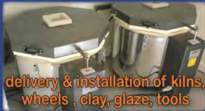
delivery & installation of kilns, wheels, clay, glaze, tools

serving talented people nationwide info@northernkilns.com 01253 790307