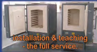
installation & teaching - the full service.