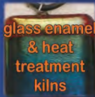
glass enamel & heat treatment kilns