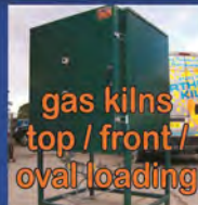
gas kilns top / front / oval loading