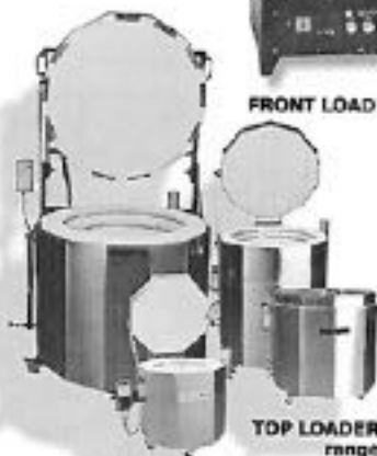
TOP LOADER range

Cromartie Kilns Ltd Park Hill Road, Longton Stoke on Trent ST3 5AY U.K. Tel: 01782 313947 Fax: 01782 599723 email: enquiries@cromartie.co.uk