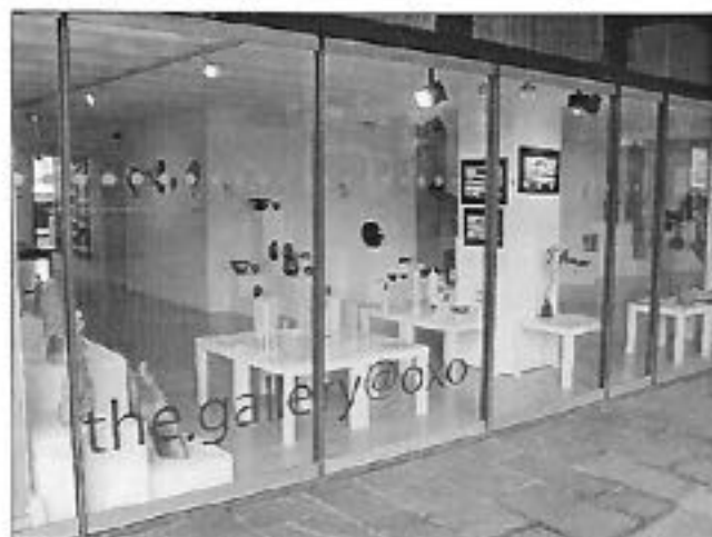
Northern Fire 1 – October 2006

'Lovely. Please put me on your mailing list.'