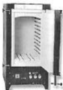
FRONT LOADER range